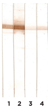
FIGURE 1. Albumin staining by five albumin-specific MAbs in Western blotting after electrophoretic separation of human plasma proteins in reducing conditions.

All antibodies presented here could be used for the detection of human serum albumin in Western blotting after gel electrophoresis under reducing and non-reducing conditions (Fig. 1).